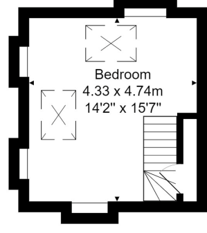
First Floor Area: 21.4 m<sup>2</sup> ... 231 ft<sup>2</sup>