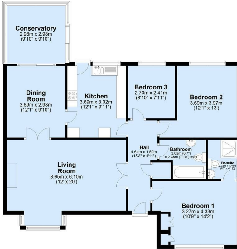
Total area: approx. 105.0 sq. metres (1130.3 sq. feet)

For identification purposes only. Plan produced using PlanUp.