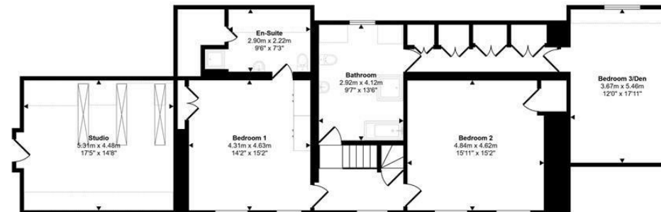
First Floor Approx 138 sq m / 1490 sq ft