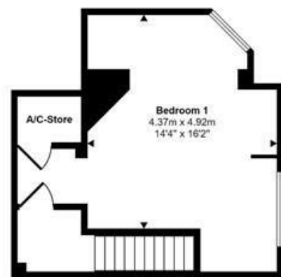
First Floor Approx 40 sq m / 427 sq ft

This floorplan is only for illustrative purposes and is not to scale. Measurements of rooms, doors, windows, and any items are approximate and no responsibility is taken for any error, omission or mis-statement. Icons of items such as bathroom suites are representations only and may not look like the real items. Made with Made Snappy 360.