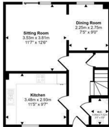
Ground Floor Approx 41 sq m / 442 sq ft

Approx Gross Internal Area 110 sq m / 1182 sq ft