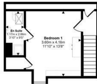
Second Floor Approx 27 sq m / 293 sq ft