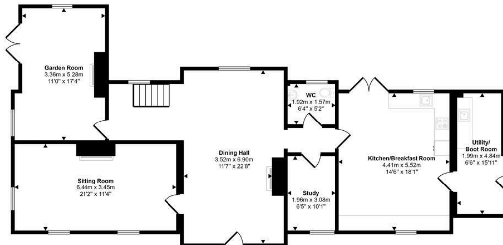
Ground Floor Approx 127 sq m / 1366 sq ft

Approx Gross Internal Area 232 sq m / 2495 sq ft