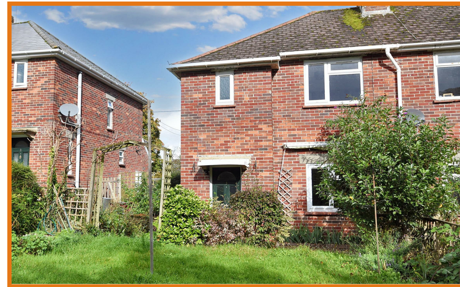
Honeymead Lane Sturminster Newton