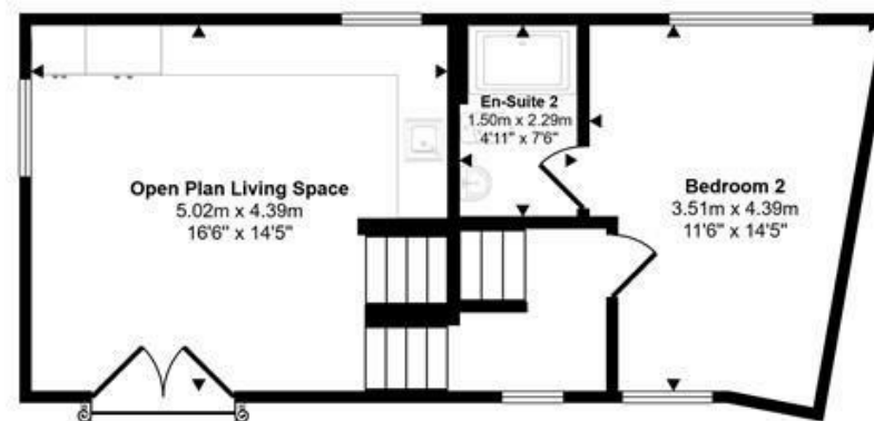
First Floor Approx 44 sq m / 473 sq ft