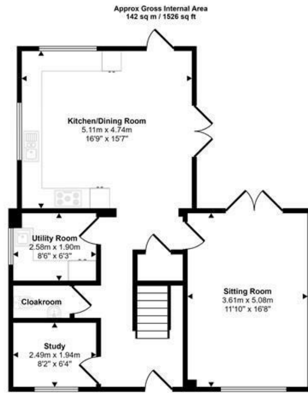
Ground Floor Approx 70 sq m / 755 sq ft