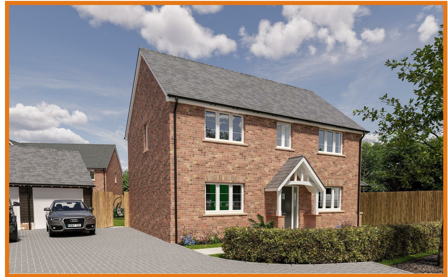
Shillingstone Lane Okeford Fitzpaine