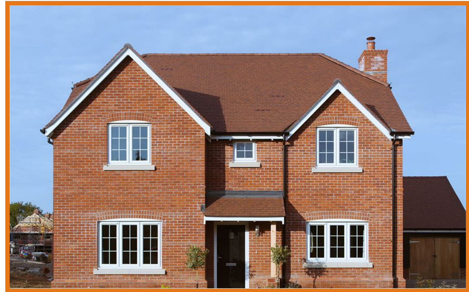
Shillingstone Lane Blandford Forum