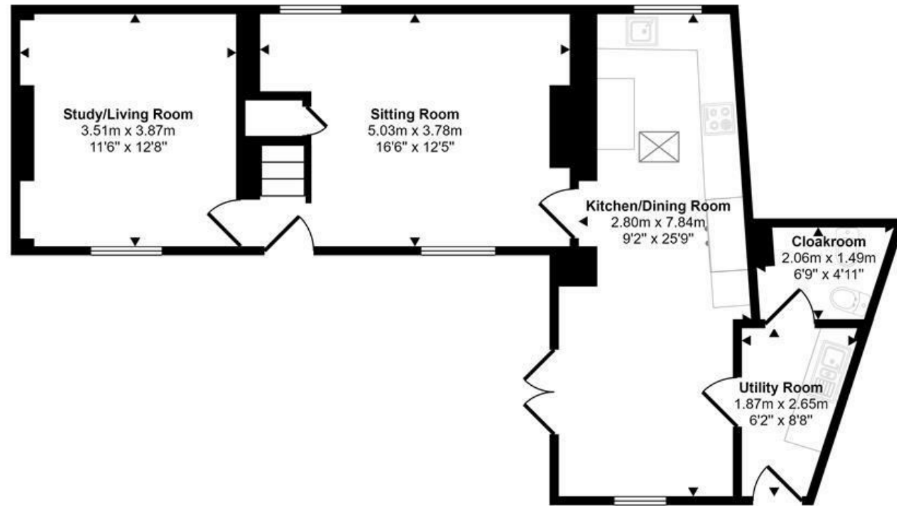
Ground Floor Approx 64 sq m / 693 sq ft

Approx Gross Internal Area 100 sq m / 1075 sq ft