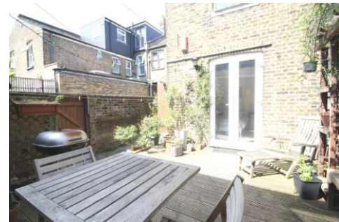
Mortimer Road, Kensal Rise NW10 £2,100 pcm