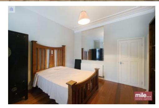
Denholme Road, London £625,000 Share of Freehold

Offered in fabulous condition, the property has been redecorated to a beautiful standard and boasts a gorgeous reception room, separate kitchen with fully fitted appliances, two double bedrooms (one with built-in cupboards) and a modern three piece bathroom.