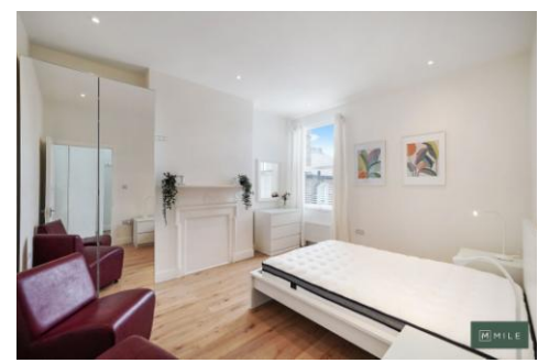
Furness Road, London NW10 £2,750 pcm

Welcome to Furness Road; a stunning three bedroom newly refurbished apartment. Welcome to Furness Road, where comfort and convenience converge! This newly refurbished three-bedroom rental offers contemporary living at its finest. Step inside to discover an inviting open-plan kitchen and living area, ideal for both relaxation and entertaining. With two bathrooms, including an ensuite, convenience is always at hand. Furnished with tasteful décor, this residence is ready for you to move in and make it your own. Located in a desirable area, you'll find yourself within easy reach of amenities, transport links, and everything you need for modern living. Don't miss out on the opportunity to call this property home. It's available now, so seize the chance to experience the perfect blend of style and functionality on Furness Road.