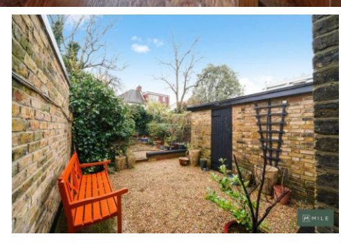
Leighton Gardens, London NW10 £1,275,000 Freehold

Welcome to Leighton Gardens, where classic charm meets modern potential in this delightful period home. Nestled on a well-regarded road in Kensal Rise, this terraced property boasts three bedrooms and endless possibilities for expansion. With potential to extend into the side return, rear, and even into the attic (subject to planning permission), there's ample opportunity to increase both space and square footage to suit your needs and vision. Sold chain-free, this residence presents an attractive proposition for those seeking a hassle-free move. Enjoy the convenience of a great location, with amenities and transport links within easy reach, while relishing the tranquillity of a quiet street setting. Leighton Gardens, where the promise of period elegance and future possibilities awaits.