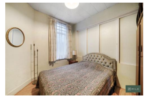
Holland Road, Kensal Heights NW10 OIEO £385,000 Leasehold