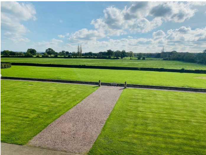
VIEW FROM LIVING ROOM

The kitchen boasts a range of attractive light oak wall, base, and drawer units, complemented by a matching island unit, stainless steel handles, and Granite work surfaces. The work surface houses a 1 1/2 bowl stainless steel sink with a mixer tap above. The kitchen also features integrated stainless steel appliances, including an oven, electric hob with stainless steel and glass canopy above, microwave, dishwasher, washing machine, and fridge freezer. A column style radiator, recessed downlights set within the ceiling, and three sash windows overlooking the manicured gardens add to the kitchen's appeal.