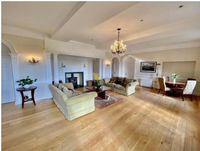
COMMUNAL ENTRANCE HALL

Turn right onto Castle Street. At the roundabout, take the 1st exit onto Grosvenor Road/A483. At the roundabout, take the 1st exit onto Wrexham Road/A483. At the roundabout, take the 2nd exit and stay on Wrexham Rd/A483. At junction 7, take the B5102 exit to Llay/Rossett/B5445/Gresford. At the roundabout, take the 1st exit onto B5102. At the roundabout, take the 1st exit onto Chester Road/B5445. Turn right onto Manor Lane and you will see Trevalyn Manor at the bottom on the right.