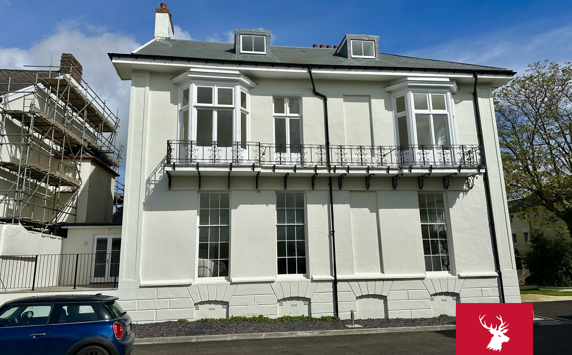
Flat 2, Riversvale