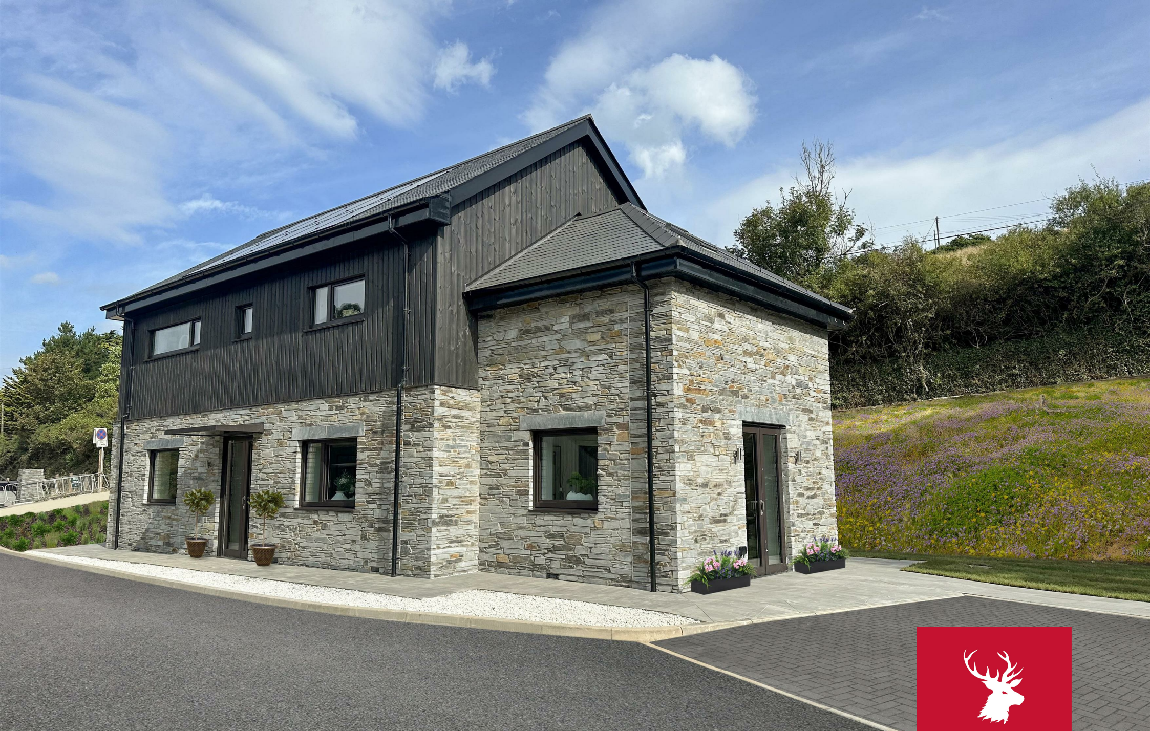
House 4, Lee Bay Gardens