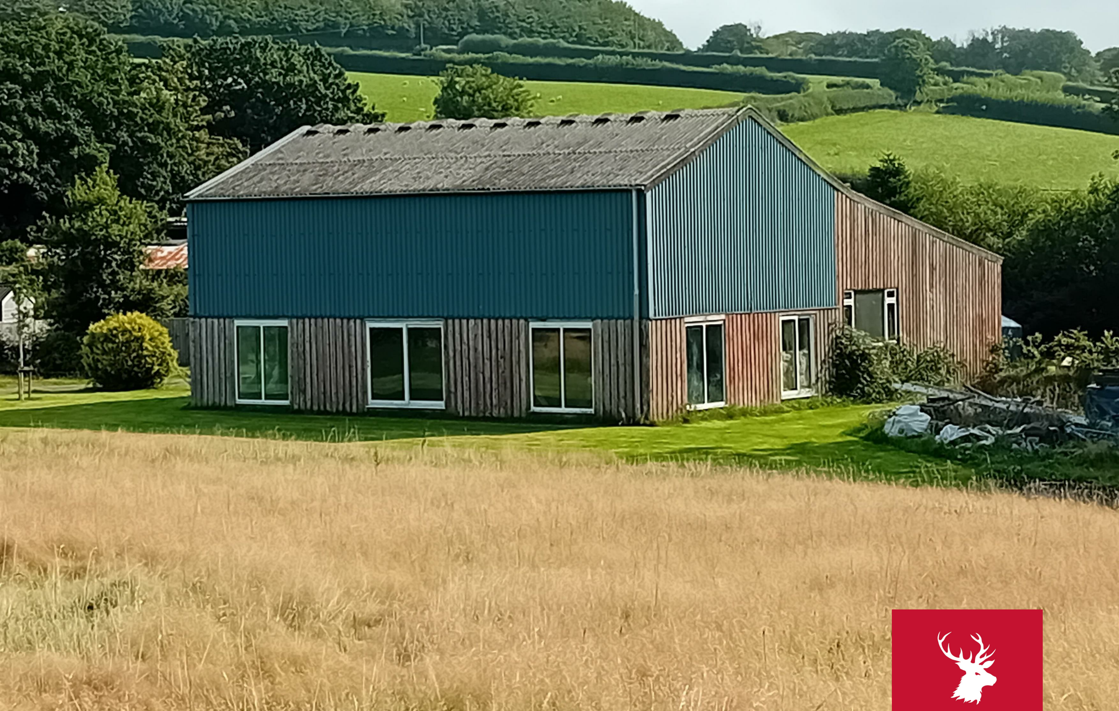
South Benton Barn