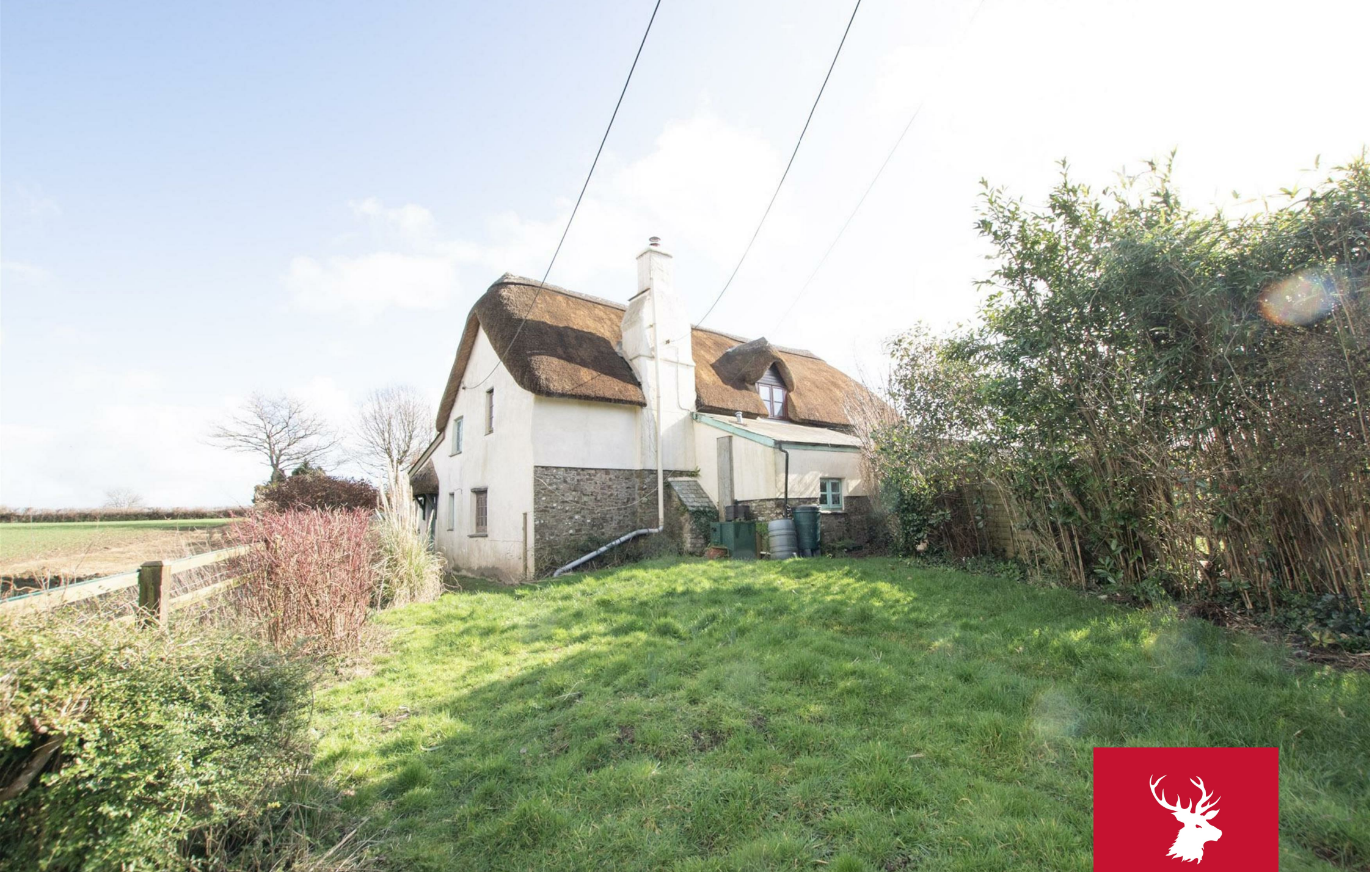
1 Kewsland Cottages