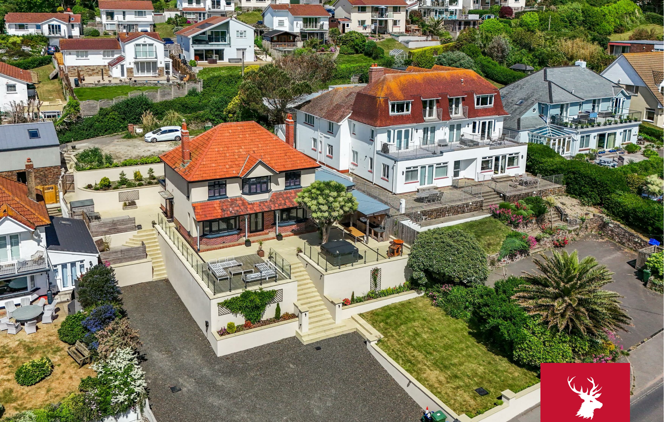
Greenbank & Building Plot