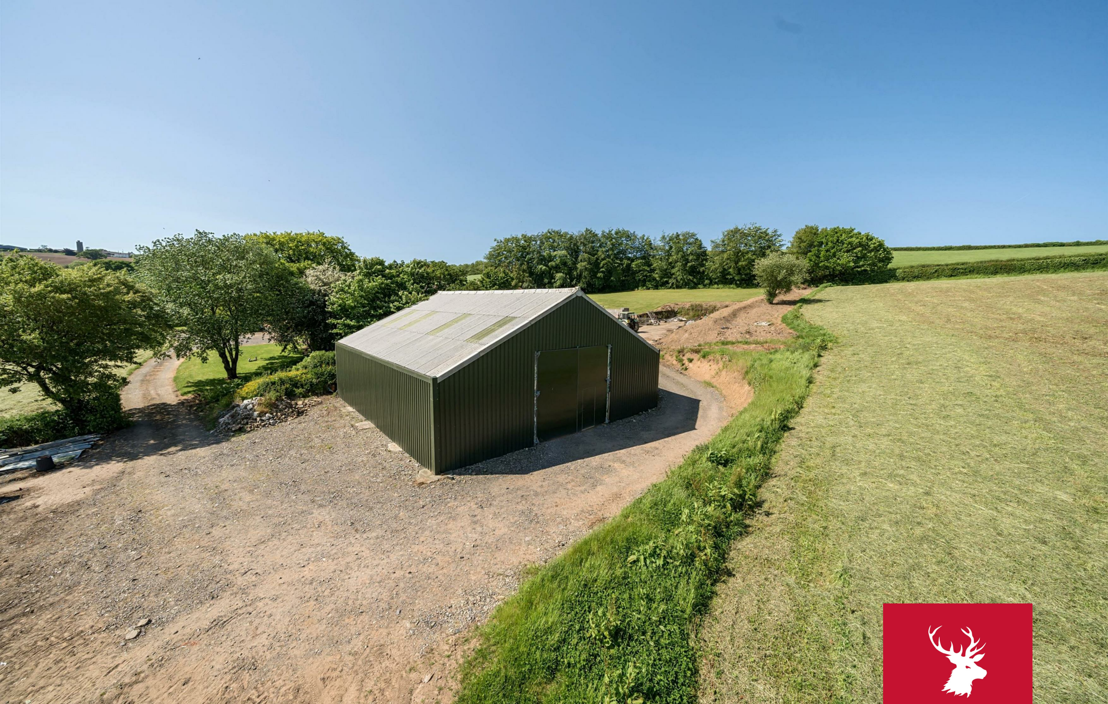
Lot 2 - Barn Park House