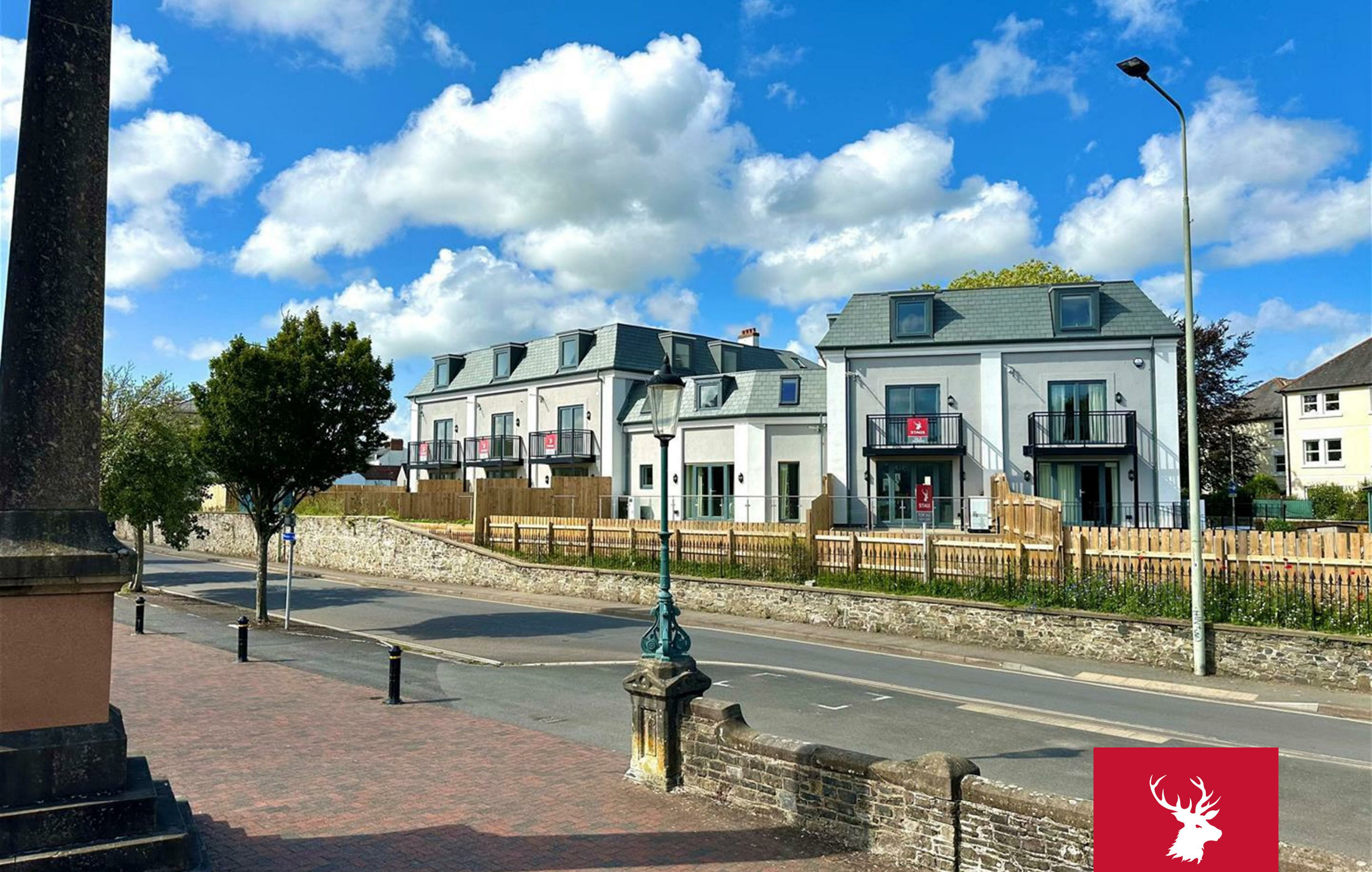
2 Riversvale Terrace