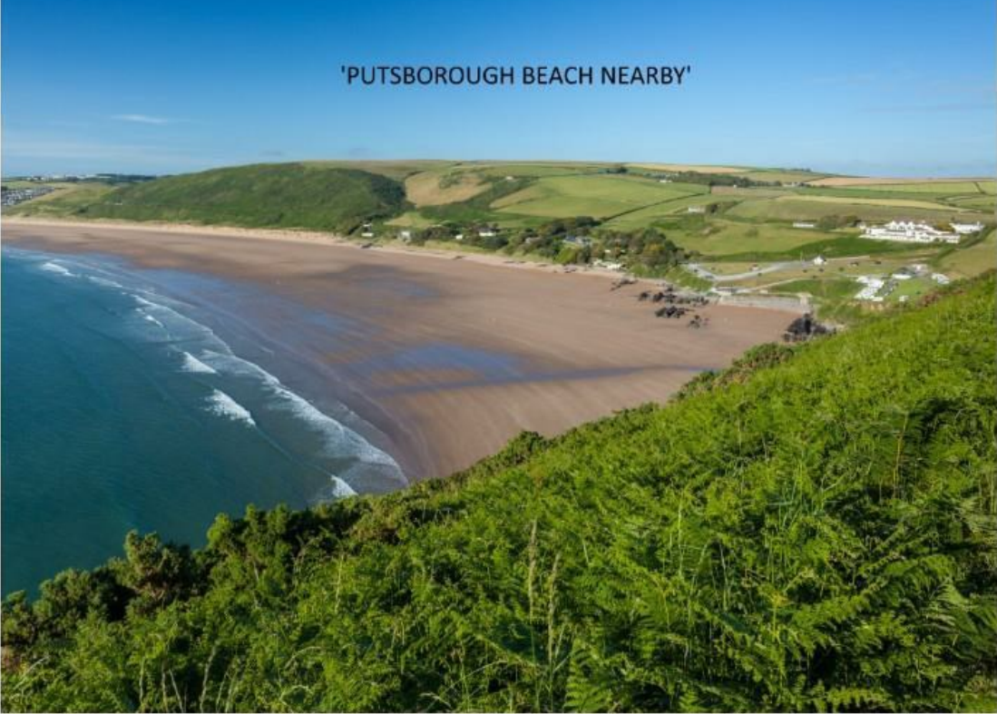
'PUTSBOROUGH BEACH NEARBY'