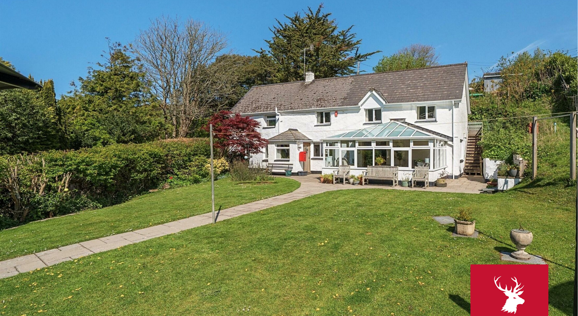
Forda Hill Cottage