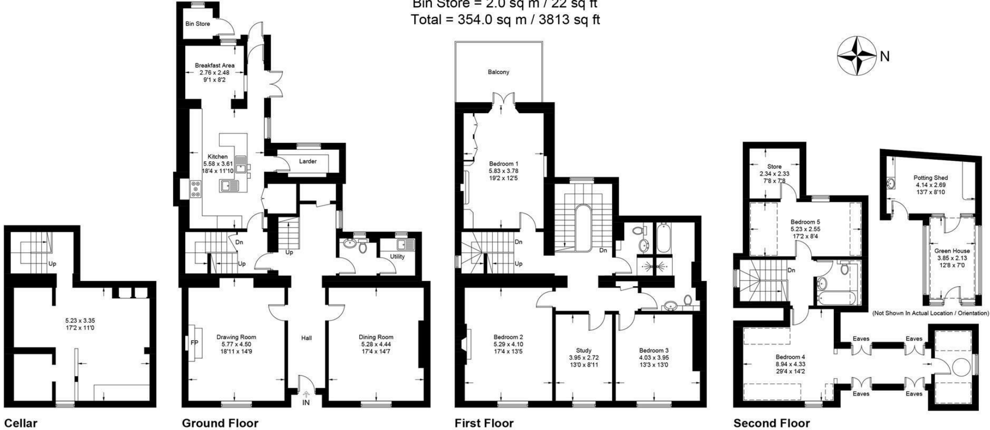
Illustration for identification purposes only, measurements are approximate, not to scale. Fourlabs.co © (ID1186627)

Approximate Gross Internal Area = 333.0 sq m / 3585 sq ft Potting Shed / Green House = 19.0 sq m / 206 sq ft Bin Store = 2.0 sq m / 22 sq ft Total = 354.0 sq m / 3813 sq ft