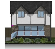
South Elevation Scale 1:100