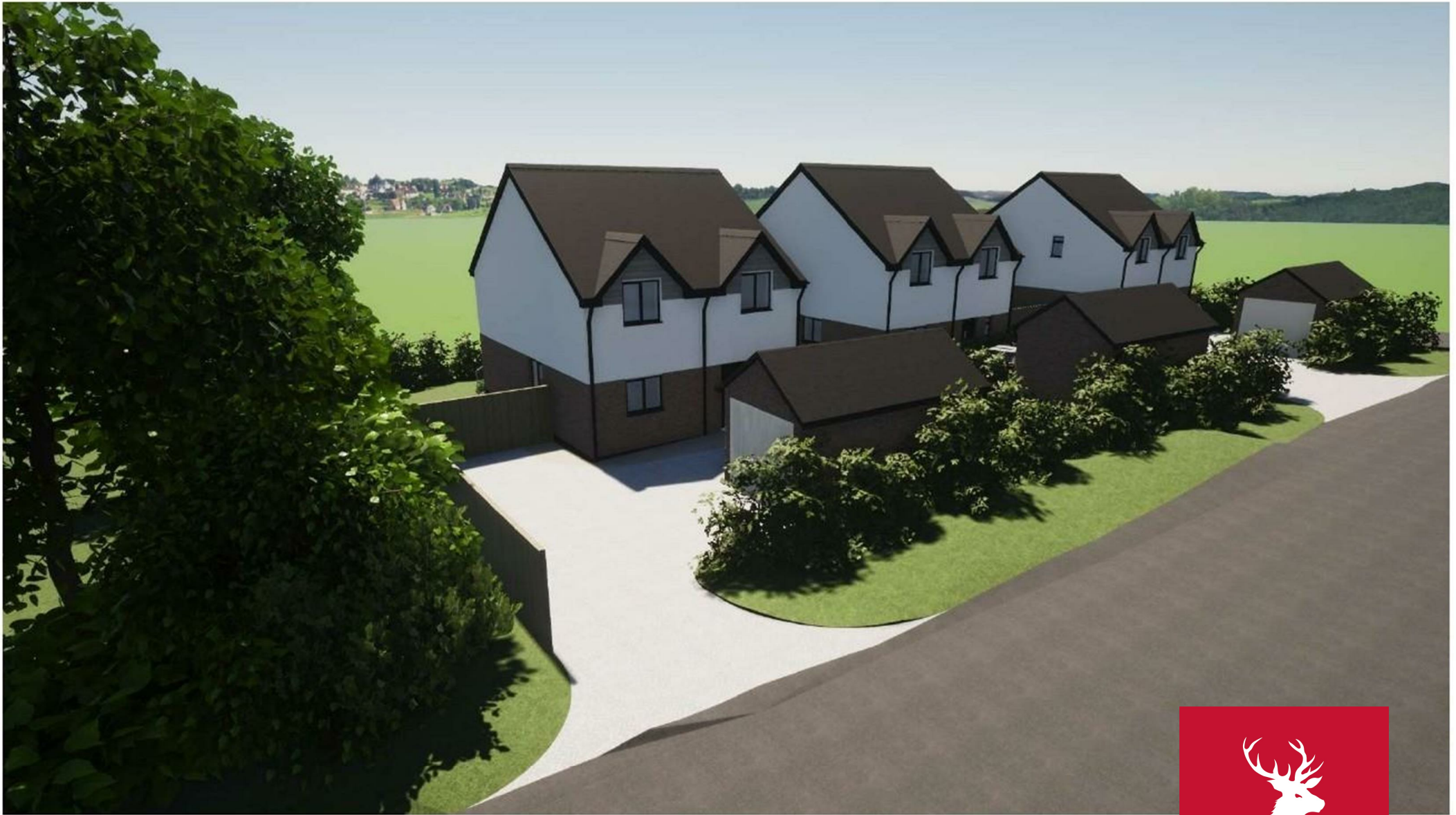
Three New Houses