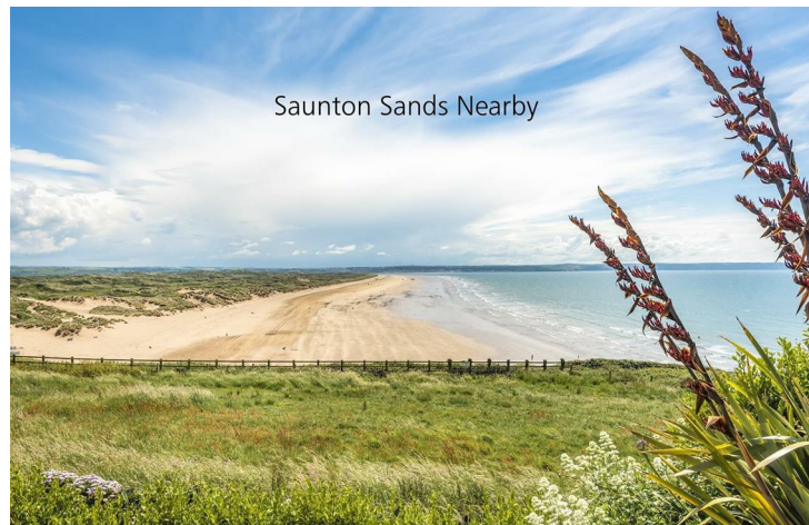
Saunton Sands Nearby