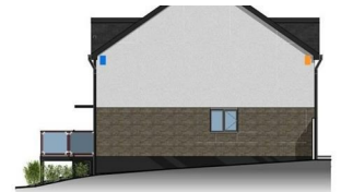
East Elevation Scale 1:100