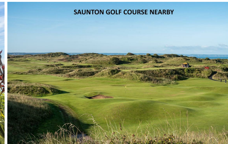
SAUNTON GOLF COURSE NEARBY