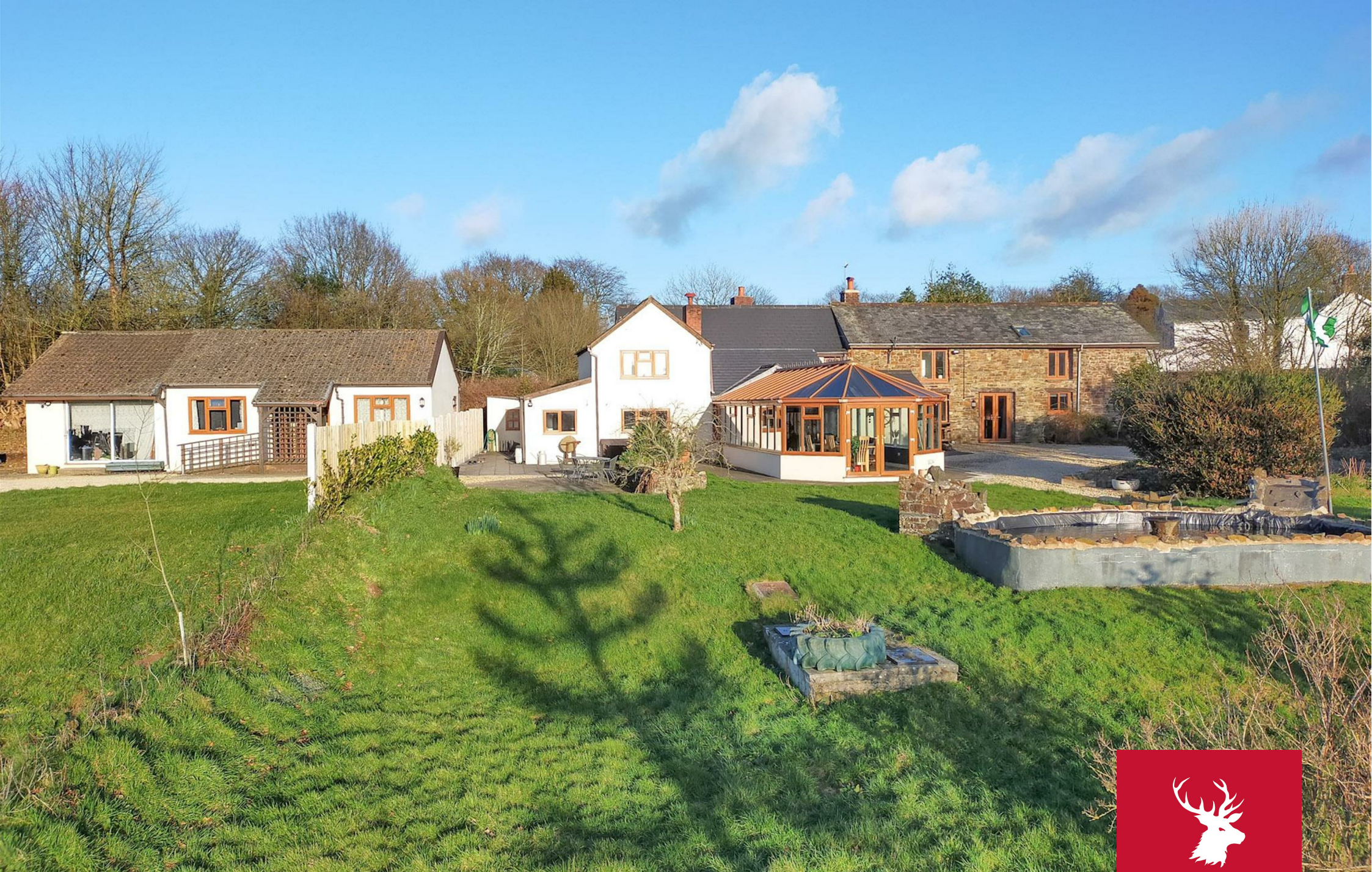
Little Eastacombe & Annexe