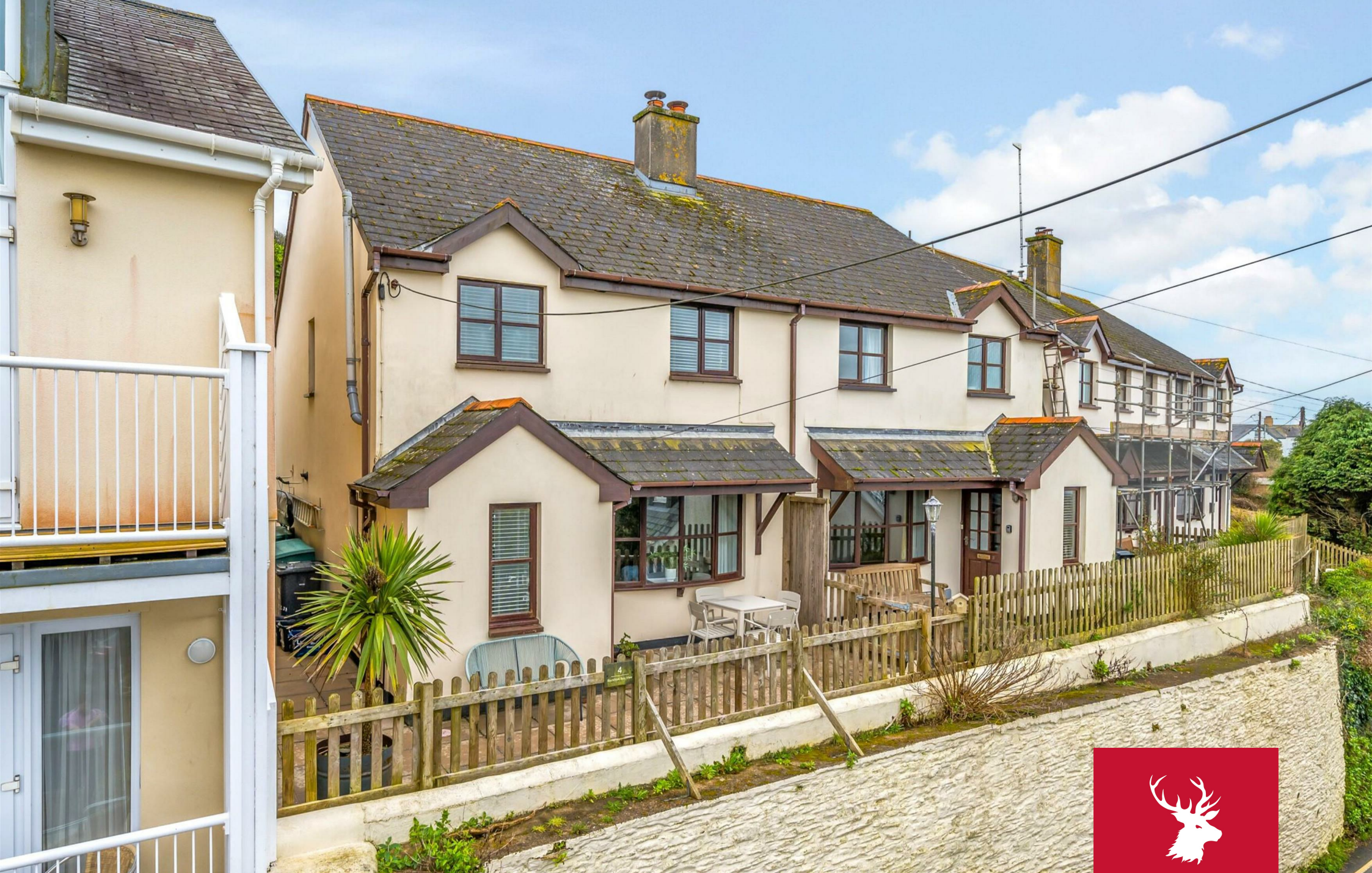
4 Rockham Bay View