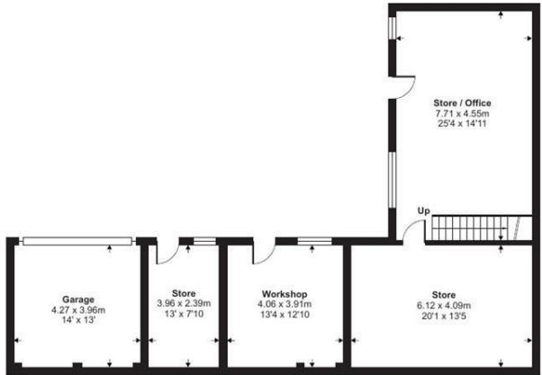
Garage / Outbuilding 1 / 2 / 3