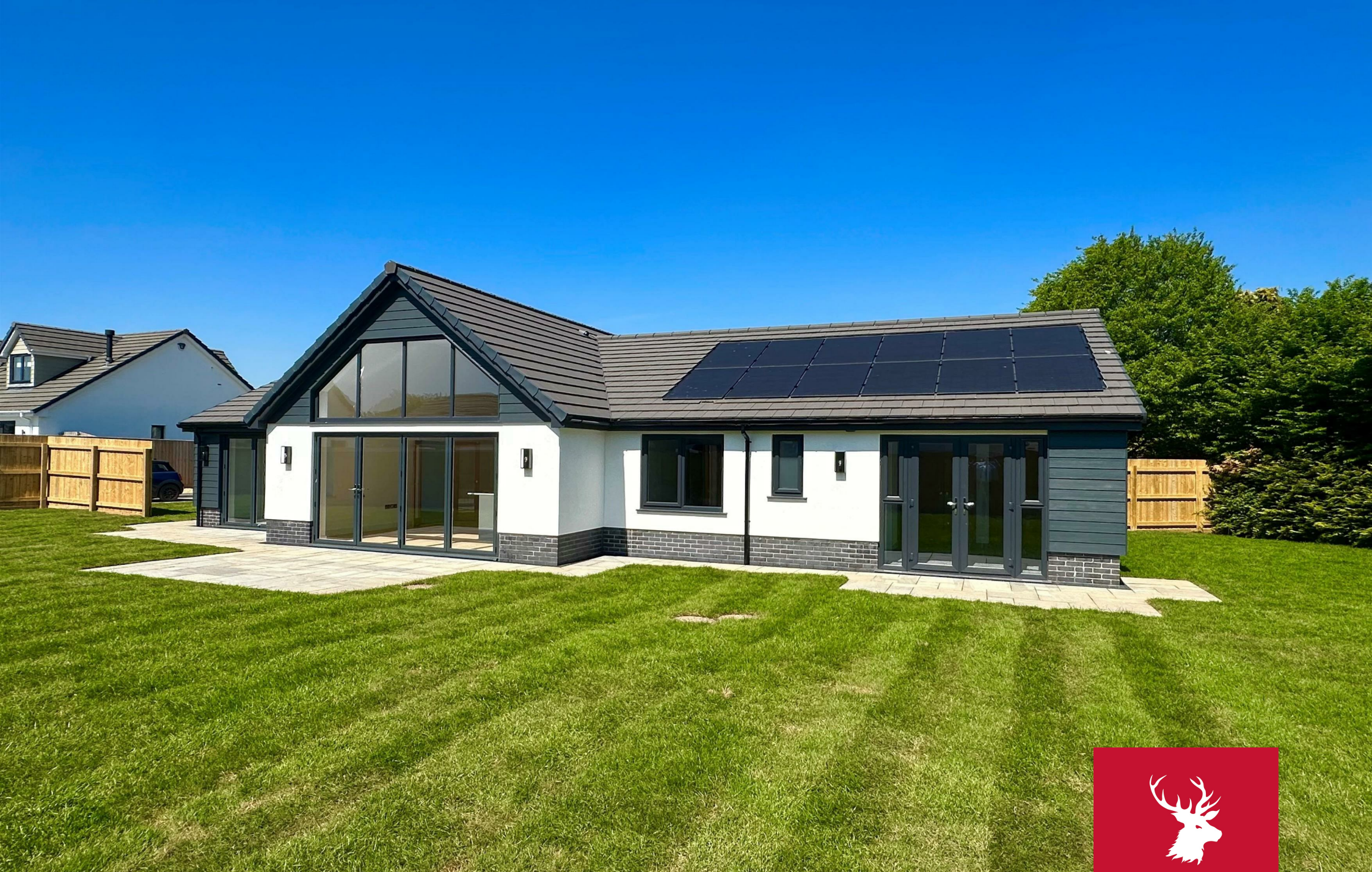
The Beeches - Plot 1