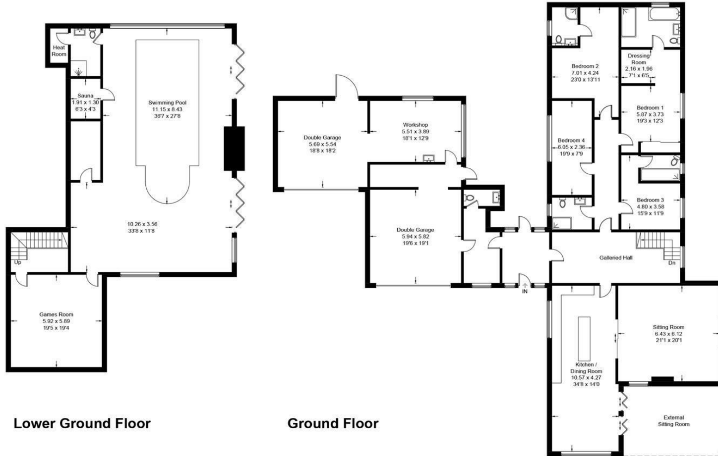
Illustration for identification purposes only, measurements are approximate, not to scale. floorplansUsketch.com © (ID1119590)

Approximate Gross Internal Area = 559 sq m / 6014 sq ft