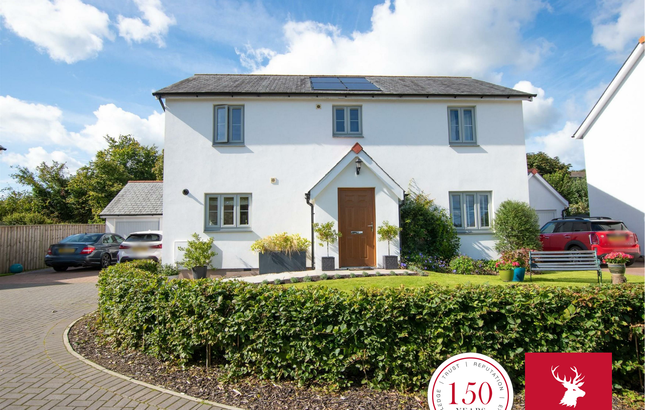
4 Bonds Farm Meadow