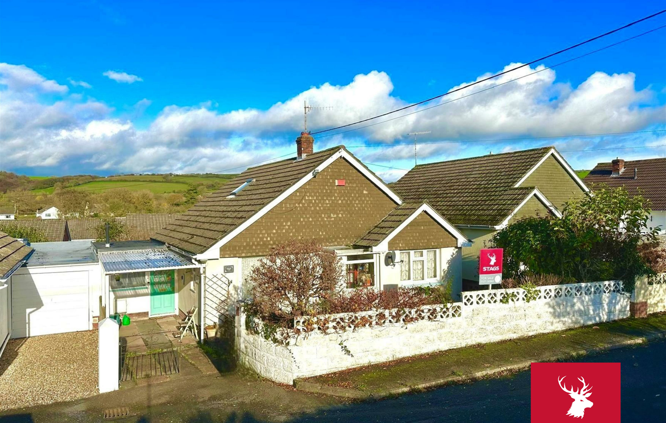
5, Meadow Close