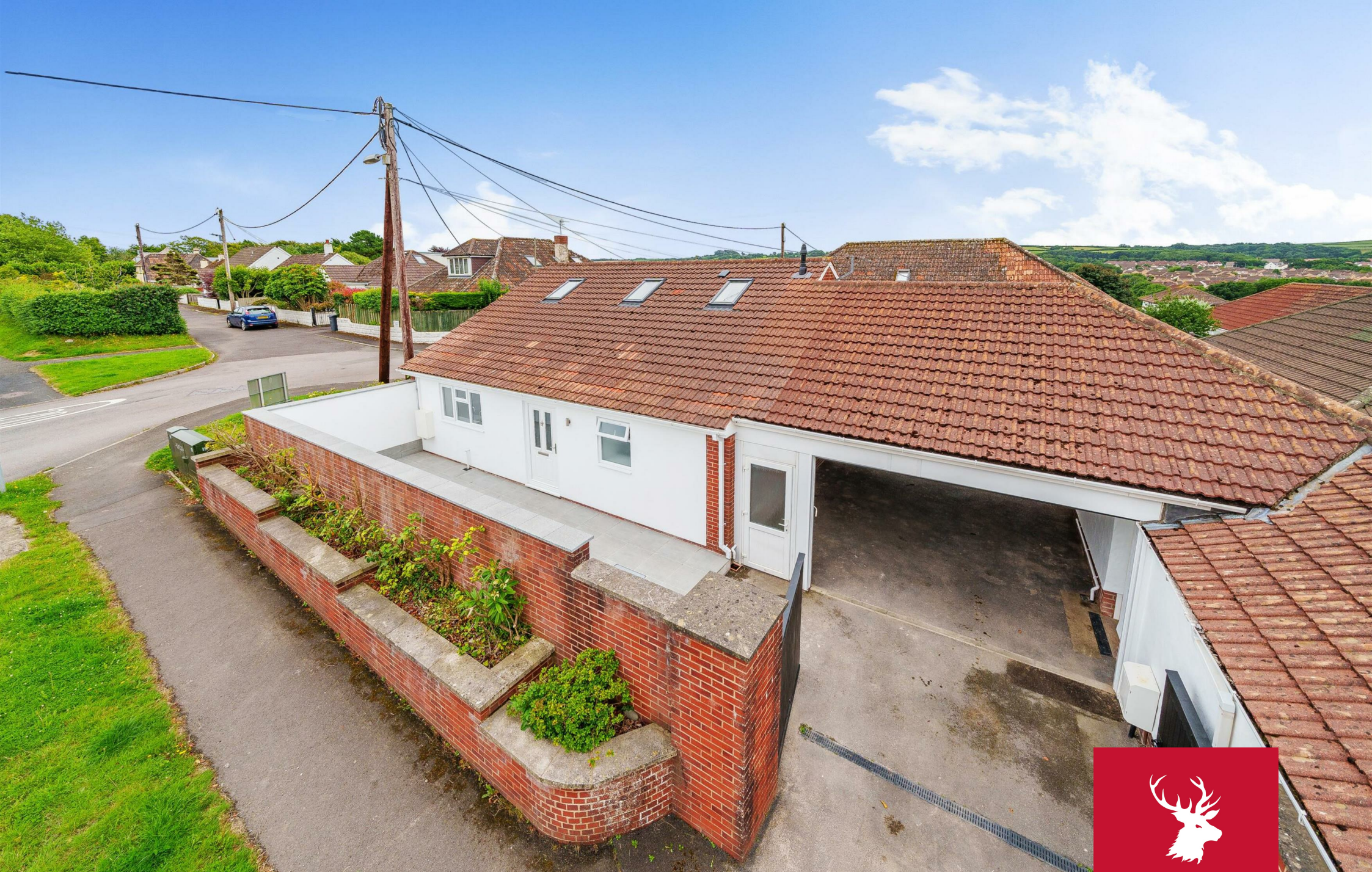
The Lodge & The Old Workshop