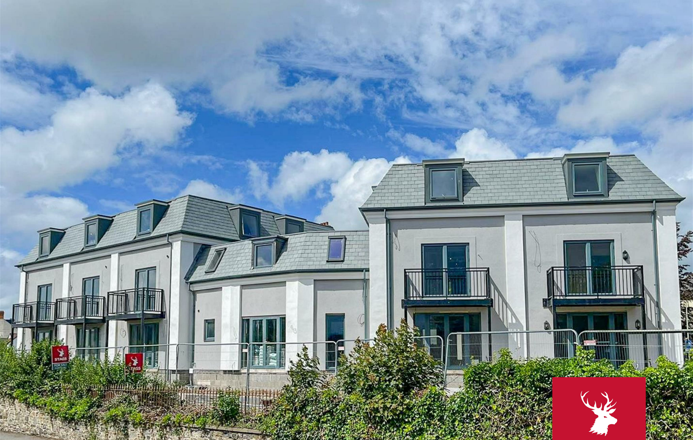
5 Riversvale Terrace