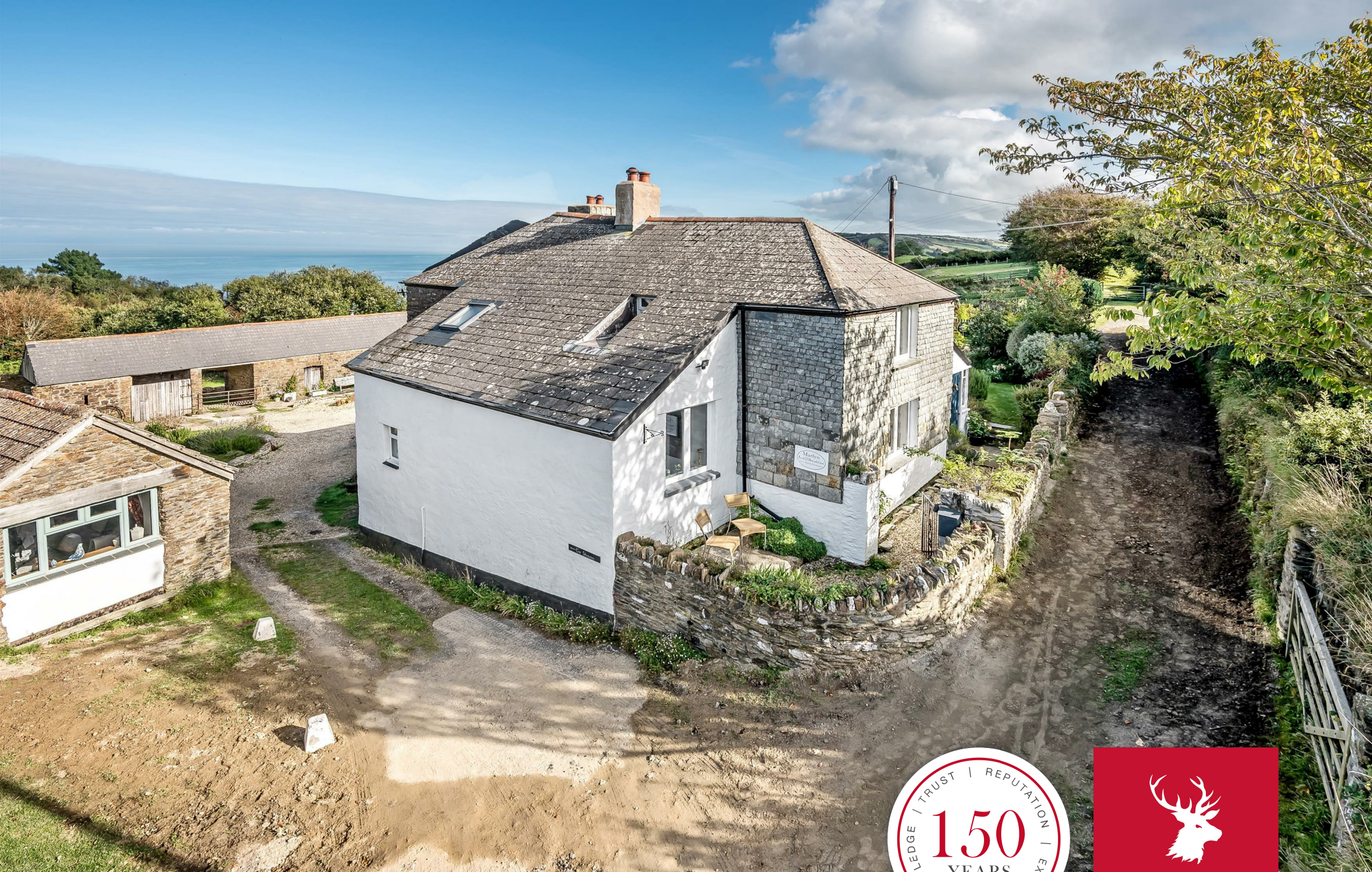
Home Barton Farmhouse