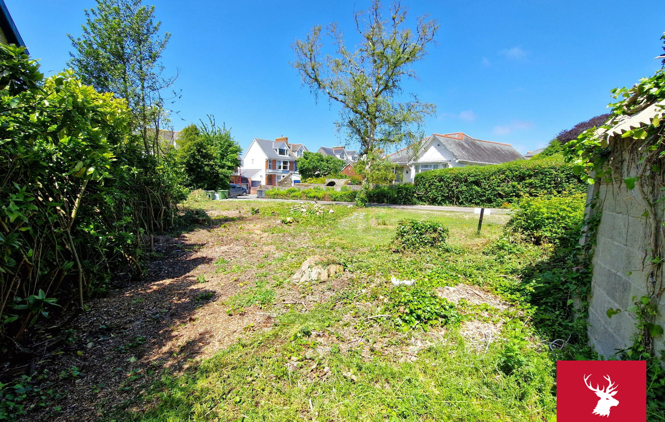
Garden Building Plot, Adjoining Bloomfield House