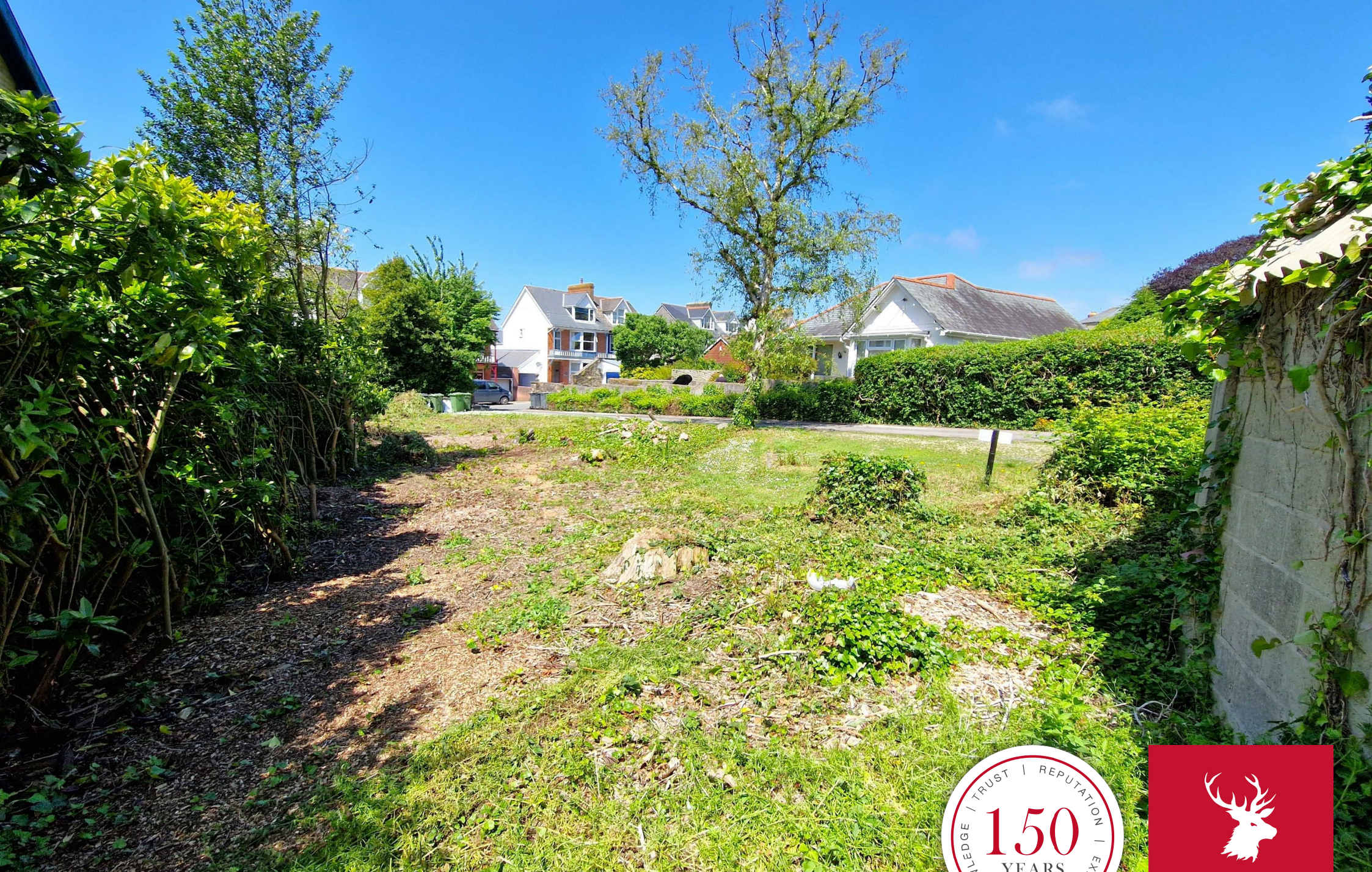
Garden Building Plot, Adjoining Bloomfield House