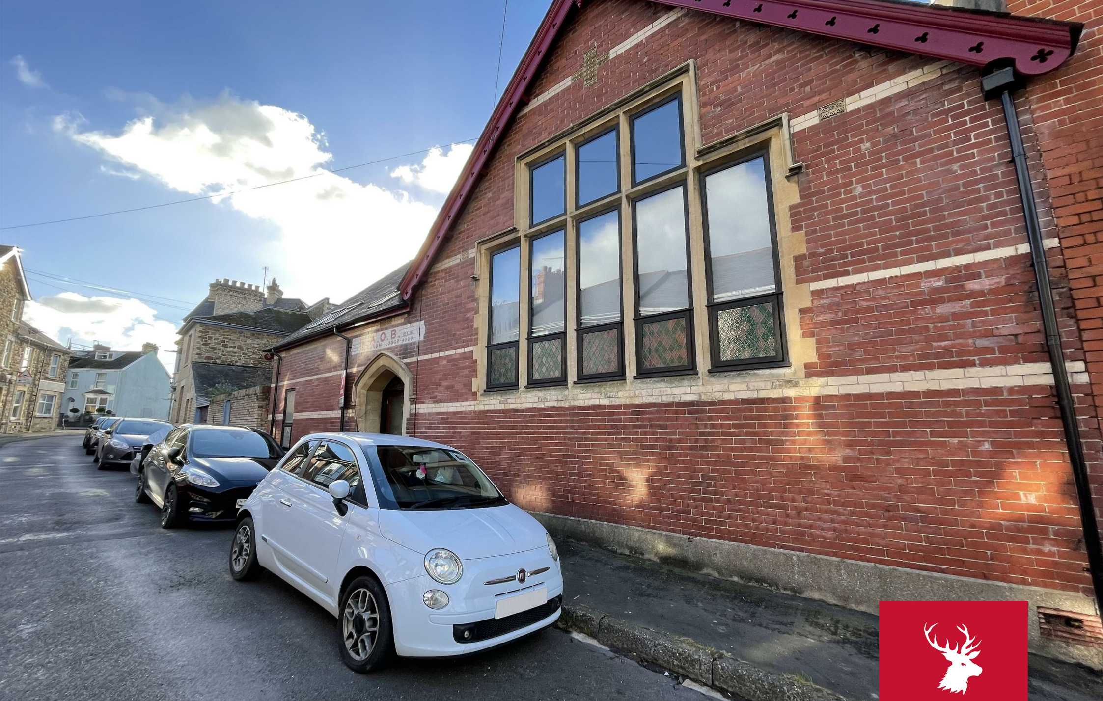
4 Ye Barum Lodge