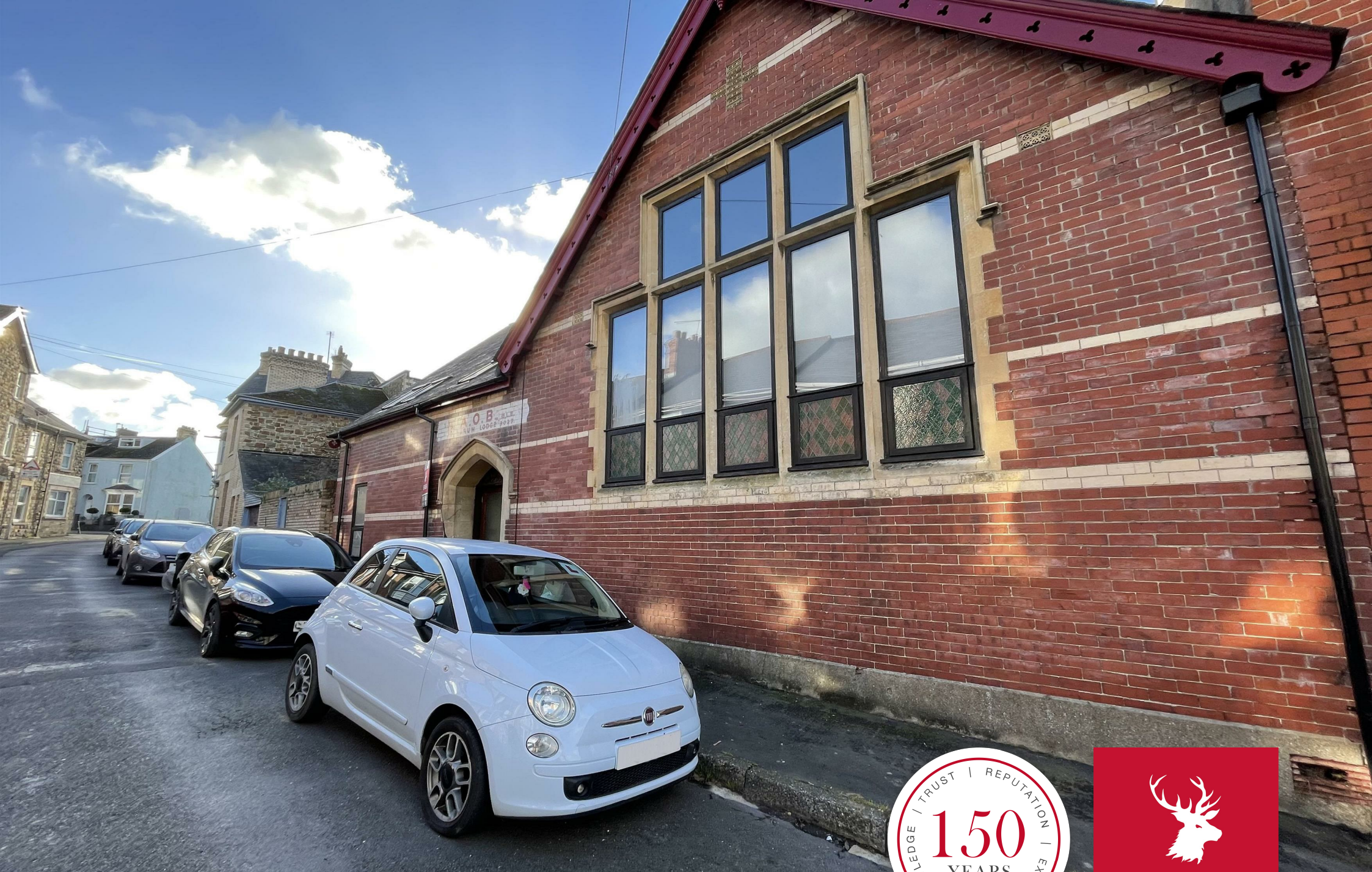
4 Ye Barum Lodge