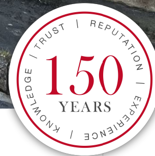
4 Ye Barum Lodge