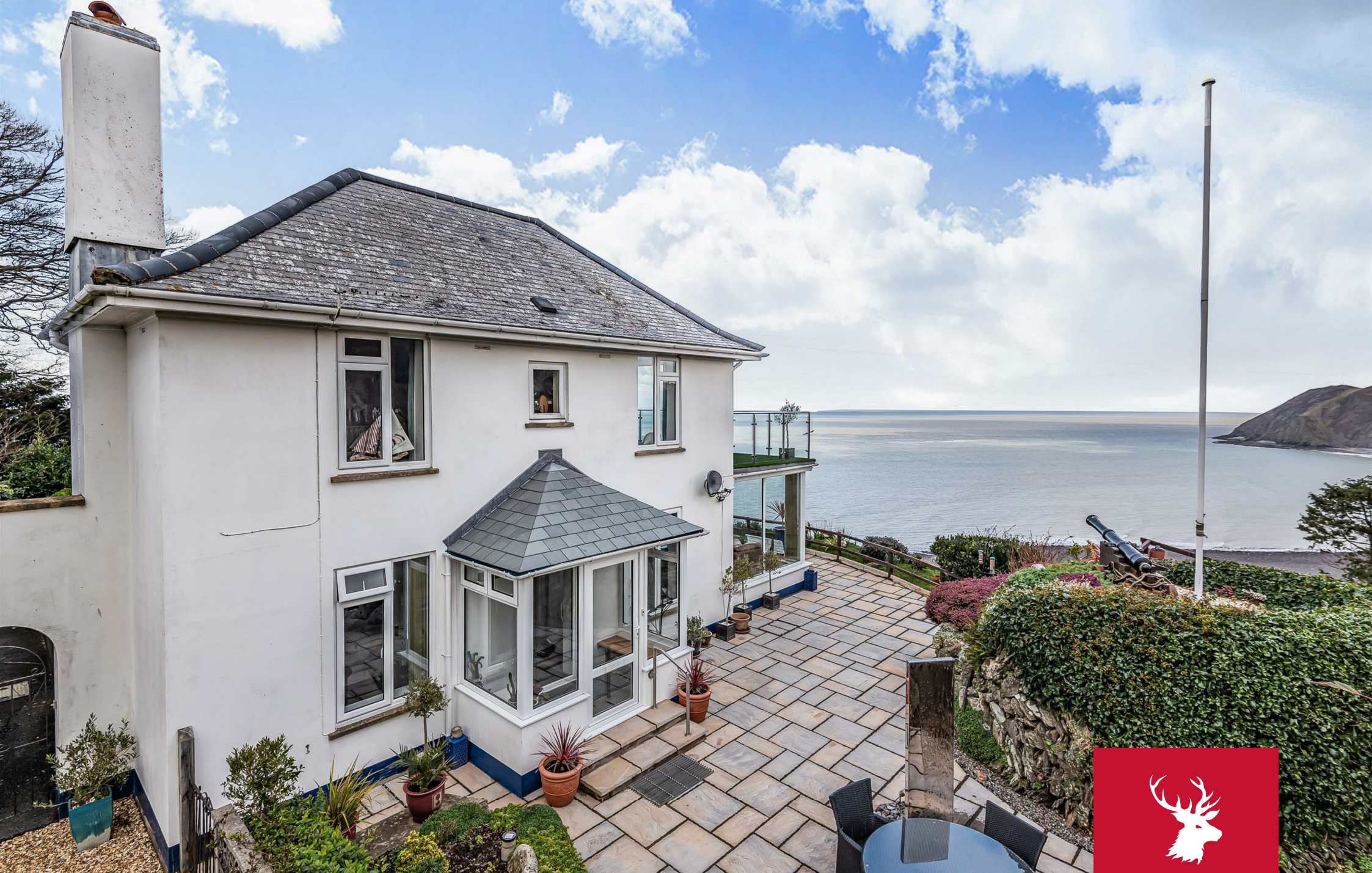
2 Police Houses