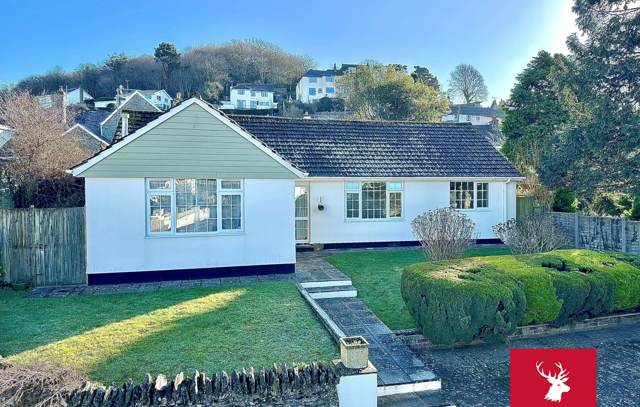
6, Broadgate Close