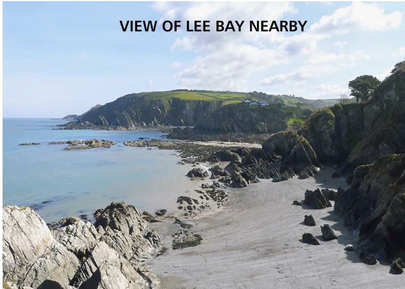
VIEW OF LEE BAY NEARBY