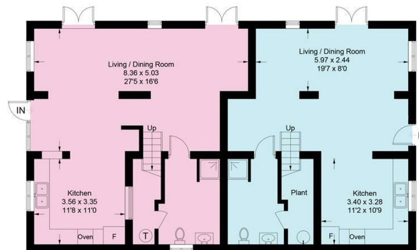
Huntington - Ground Floor