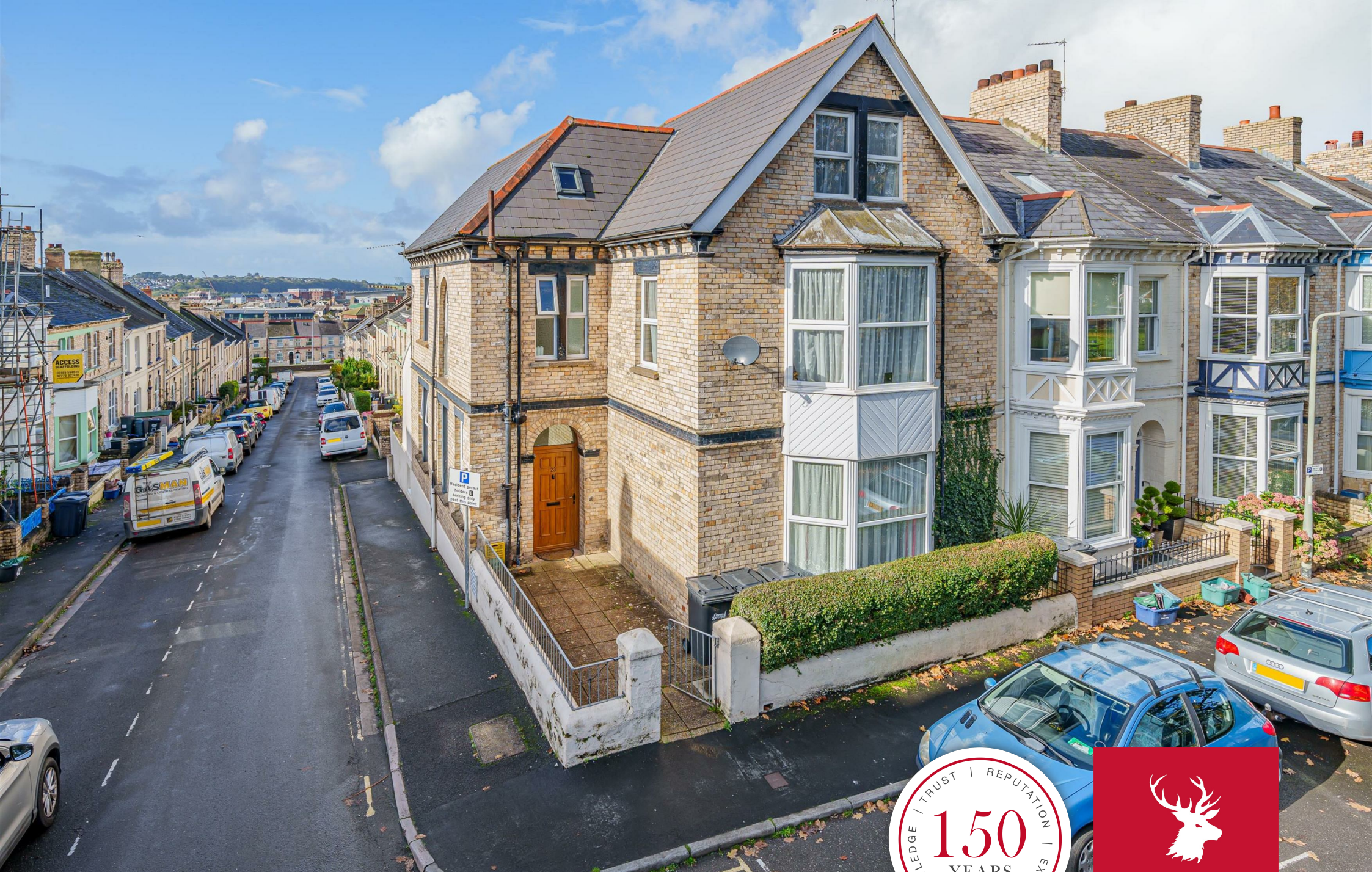
23, Hills View