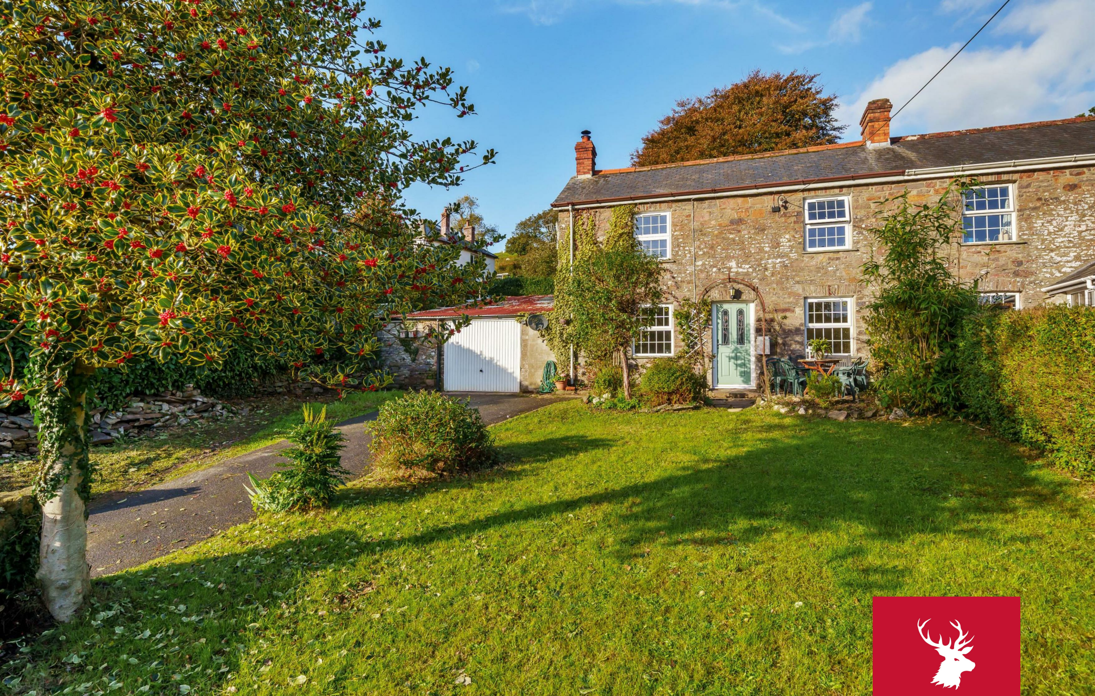
2 Rose Cottages