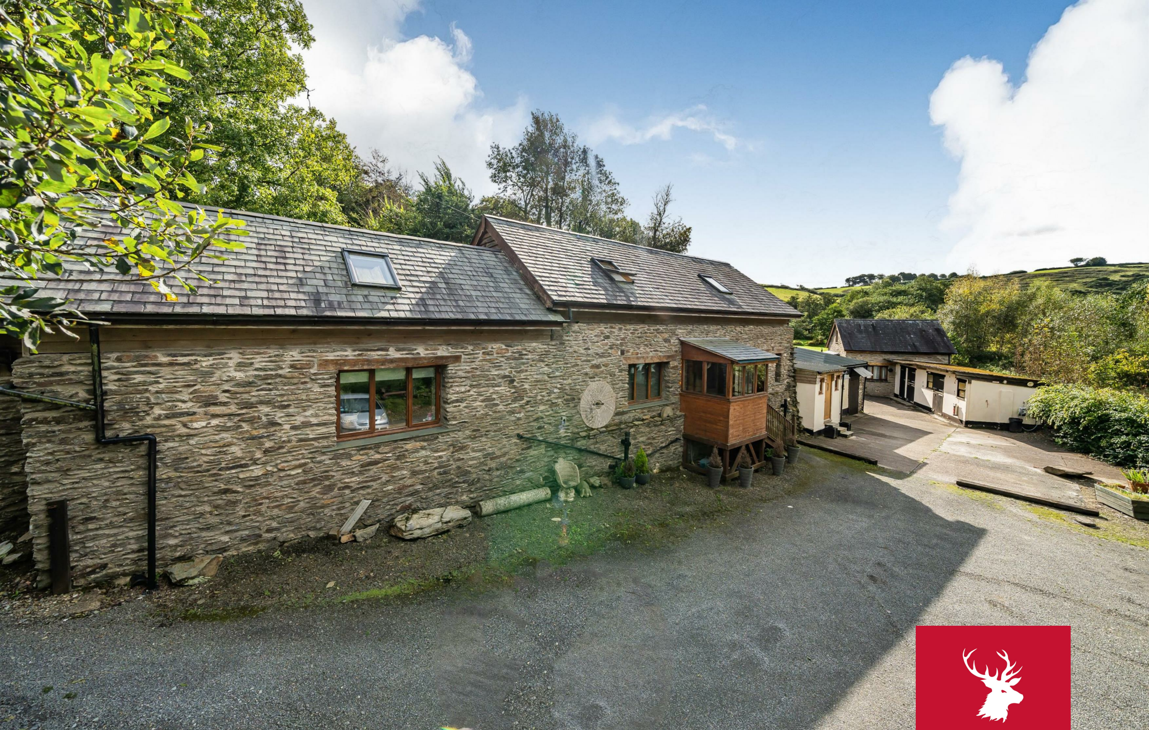
The Corn Mill & Mill Meadow Cottage